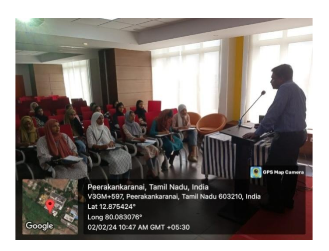
Session 2: MBA - IEV program