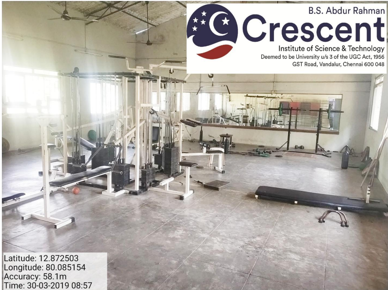
GYMNASIUM WITH WEIGHT LIFTING EQUIPMENTS ( MEN'S HOSTEL)