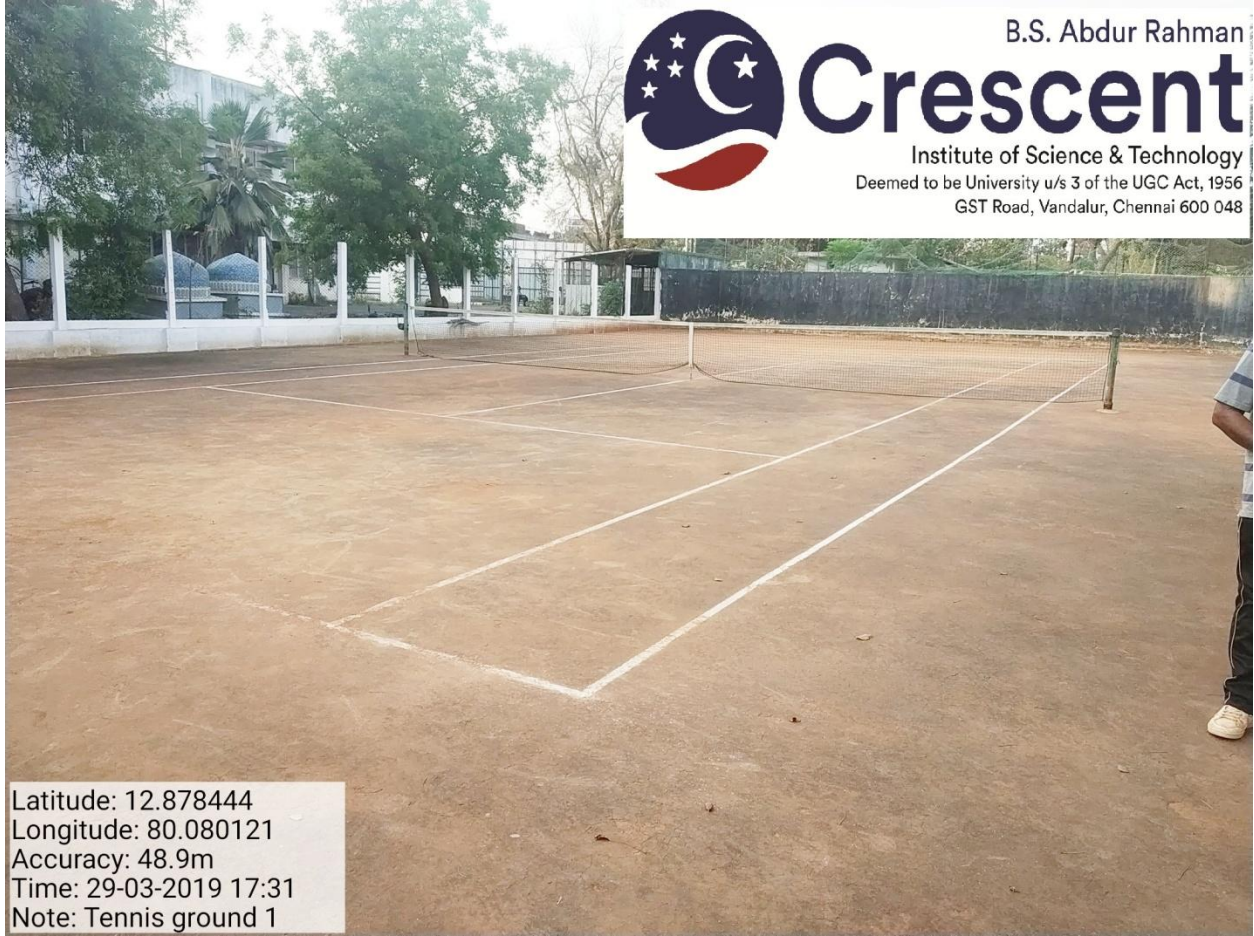
TENNIS COURT - 1