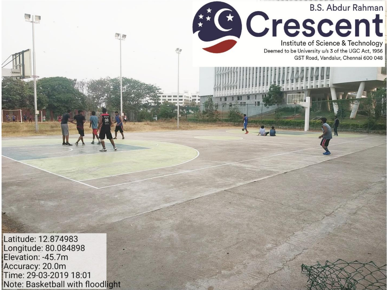
BASKETBALL COURT WITH FLOODLIGHT