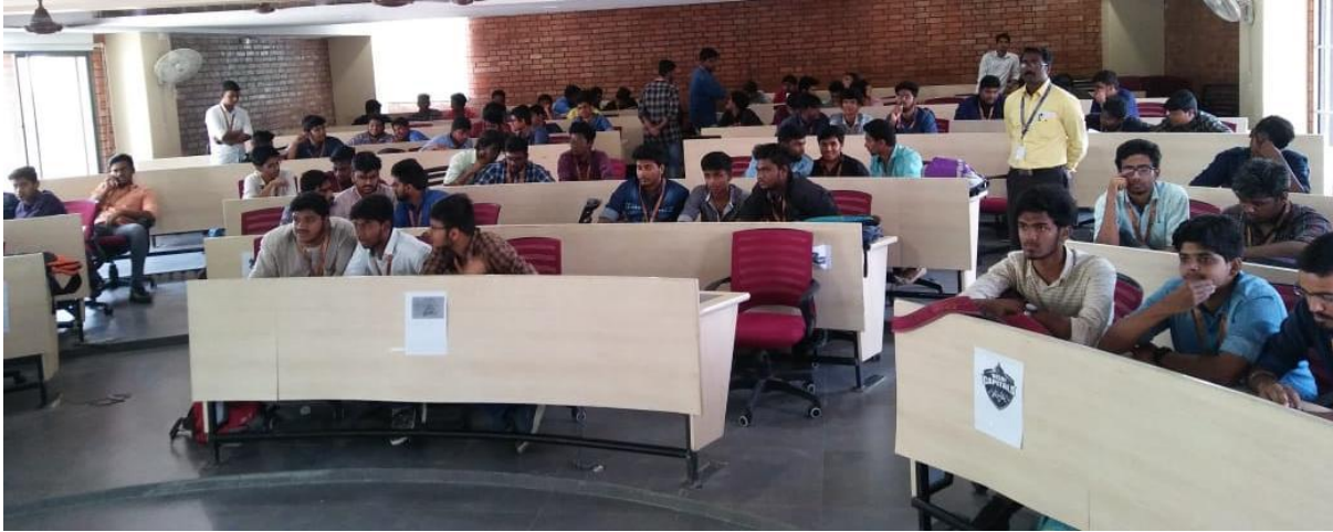
Inertia 2018 - Robo Design competition