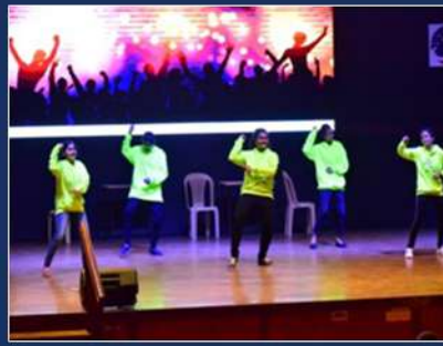
Students from second and final year performing to a dance number