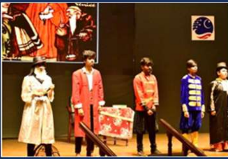
Students from final year B.A. English (Hons.) performing on stage The Merchant of Venice