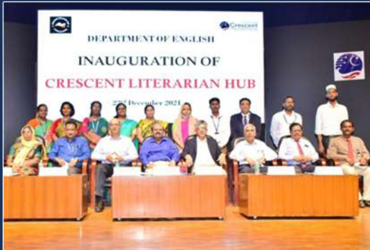
The faculty of the Department of English with the dignitaries