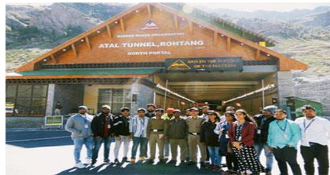
ATAL TUNNEL VISIT, HIMACHAL PRADESH visited during 23.09.2021 to 02.10.2021