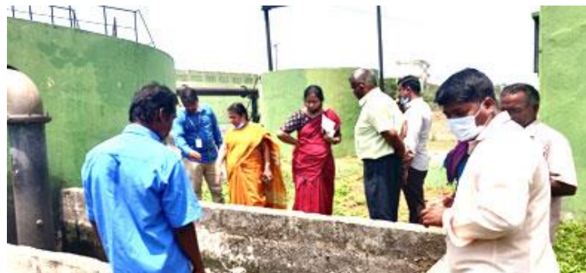
Visit to common sewage treatment plant at Maraimalai Nagar Municipality on 07.04.2022

The department involved in consultancy activities like executing repair & rehabilitation works, material testing works, design and validation of STP, soil testing and material stability for various Government, Semi-Government and Private agencies. The amount generated through consultancy and testing in the academic year 2021-22 is Rs. 1, 40,000/- (Rupees one lakh forty thousand only)