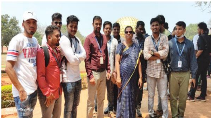
AUROVILLE, PONDICHERRY visited on 24.03.2022