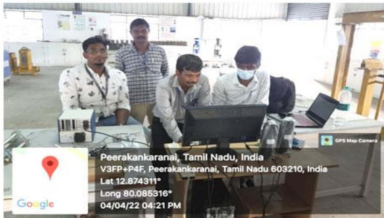
Workshop on National Instrument-DaQ system on 04.04.2022