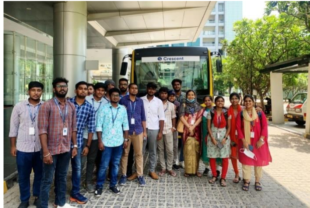
ASCENDAS, CHENNAI visited on 30.05.2022