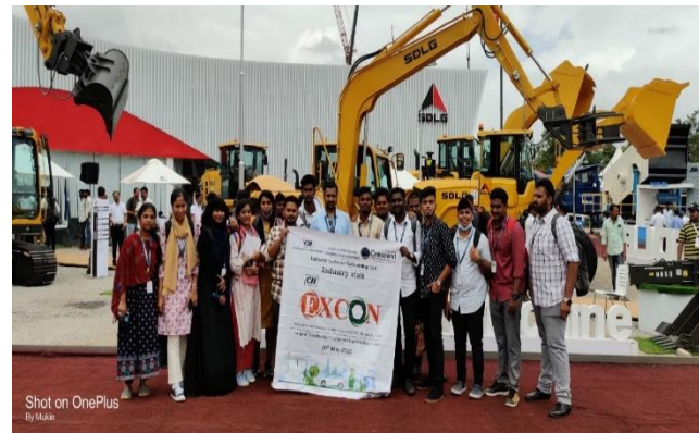
EXCON, BANGALORE visited on 20.05.2022