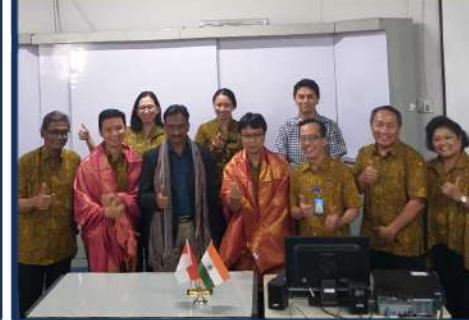
MOU with University Atma Jaya, Indonesia