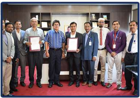
MOU with ISDC, UK