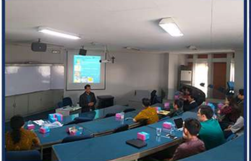
Guest Lecture at University Atma Jaya, Indonesia