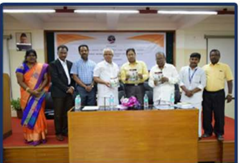
International Conference on Tamil Literature