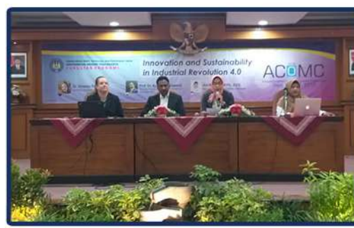
Interantional Conference Yogyakarta