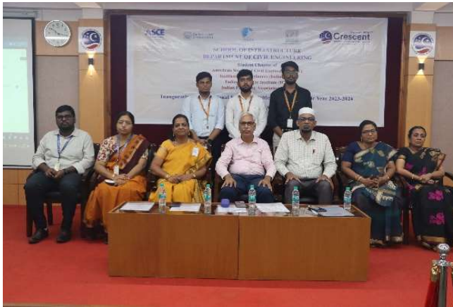
Office Bearers of ICI