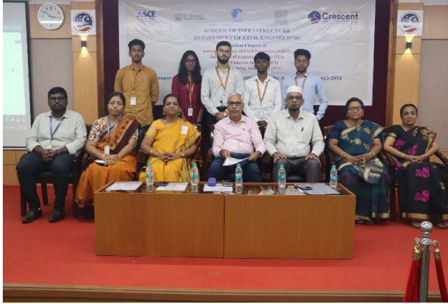
Office Bearers of ASCE