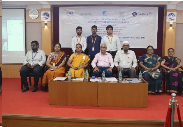
Office Bearers of IEI