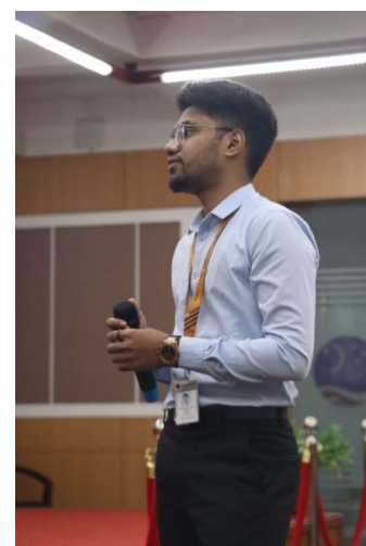
Student Interaction with Chief Guest