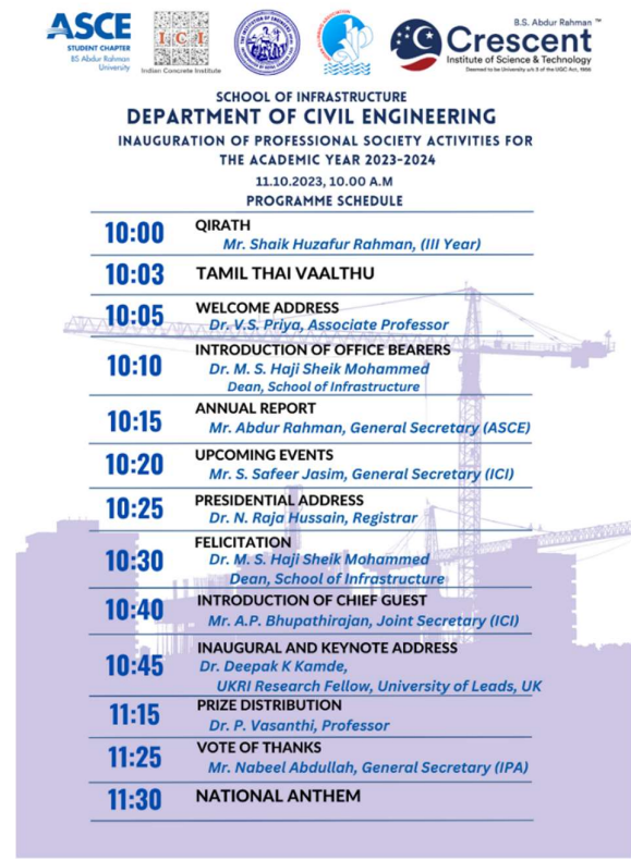
Programme Schedule of an Inauguration of Professional Society Activities