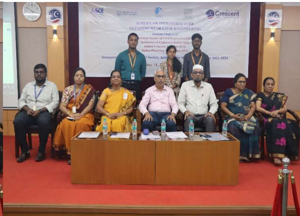
Office Bearers of IPA