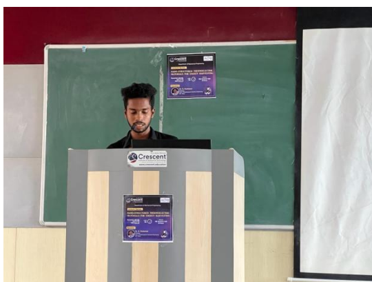
Vote of Thanks