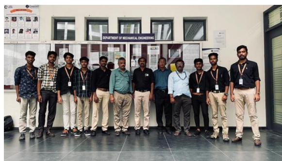
Group photo Guest and ASME members