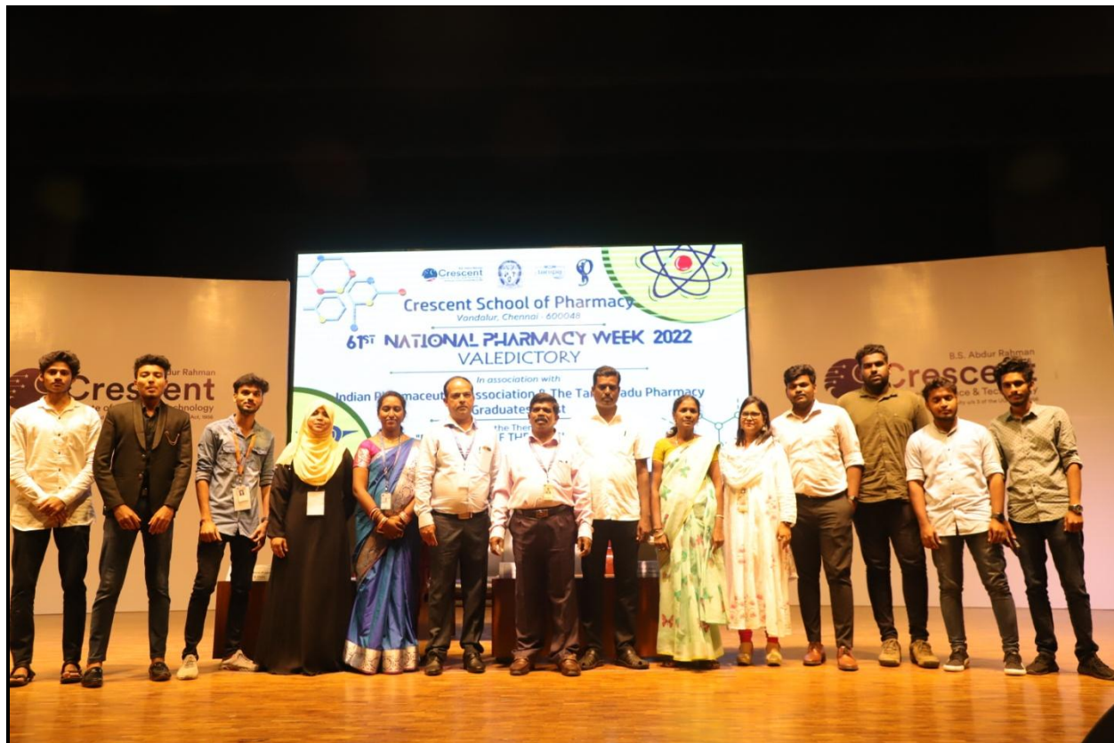
A picture with the societal activity members