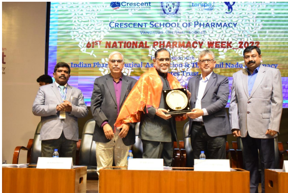
Inauguration of 61 st National Pharmacy week-2022