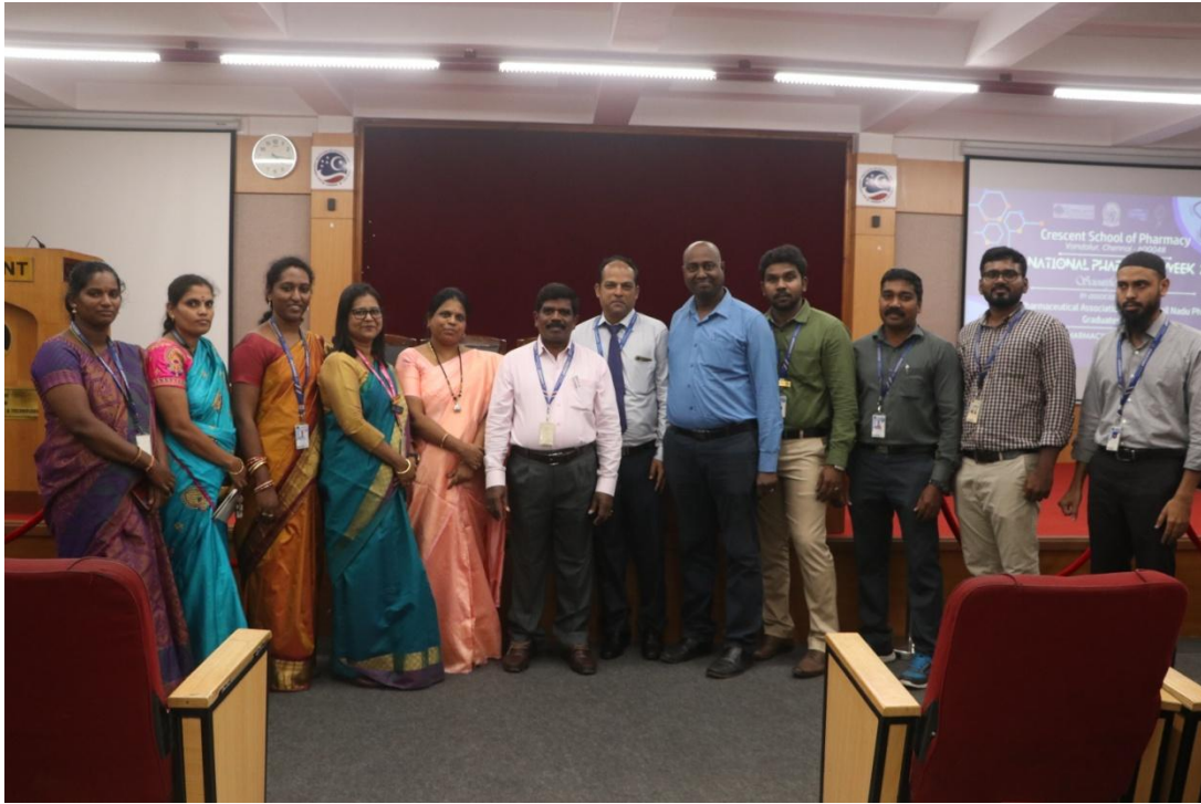
Organizing Committee Members