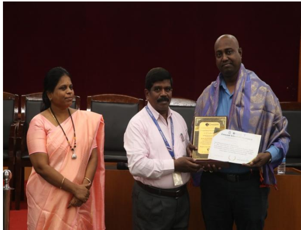
Prize Distribution after Scientific Session