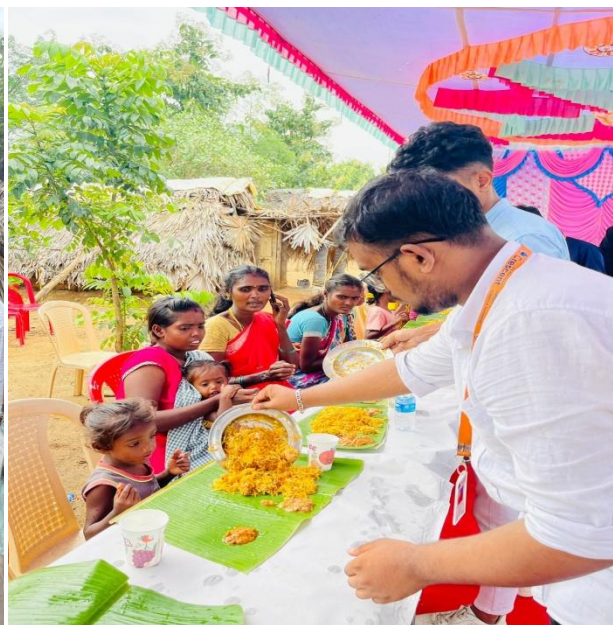
Serving Food and Provisions by students and faculty