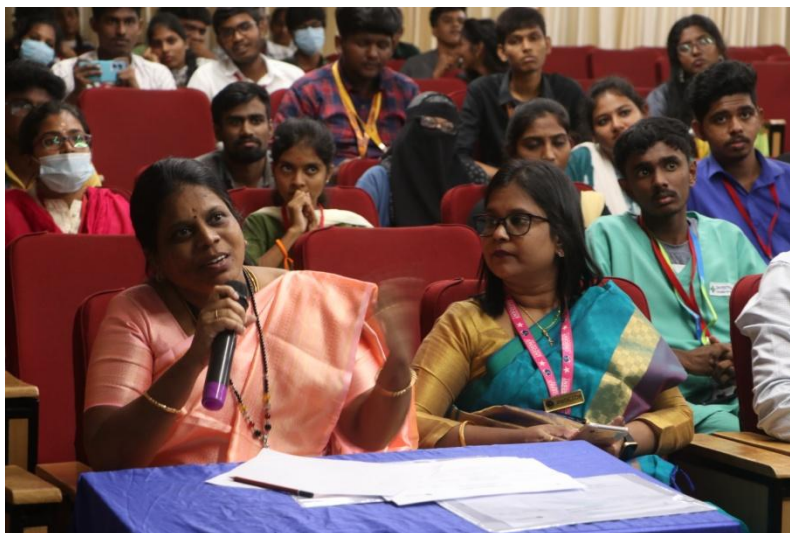
Jury Questions during presentation