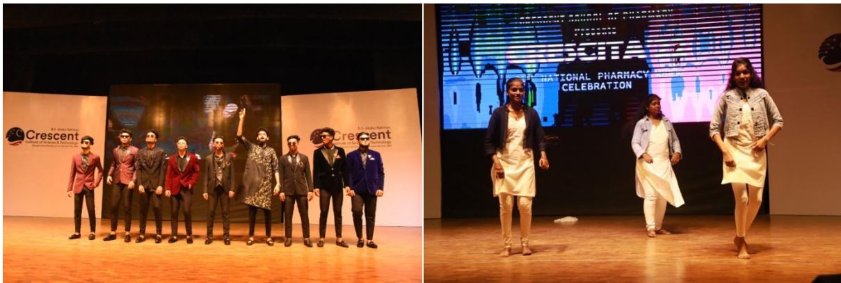
Fashion Team & Dance group

Students from different college showcased their talents on stage which was evaluated by the chief guests from the media.