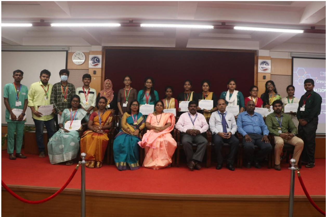
Organizing Committee with the prize winners