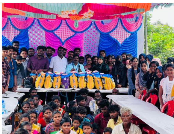
Societal activity on 22.11.2022