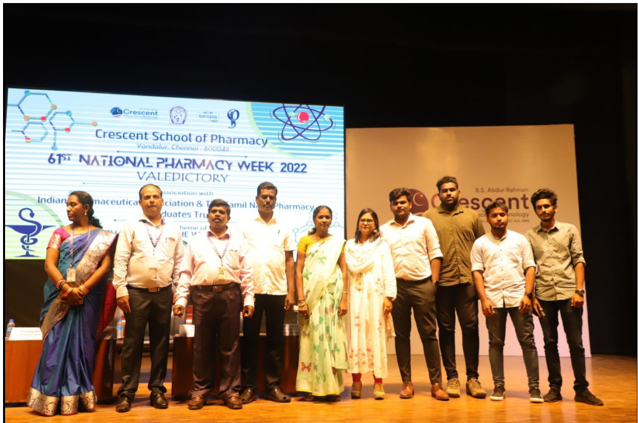
Prize Distribution for sports