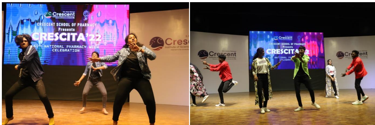
Cultural in a glimpse