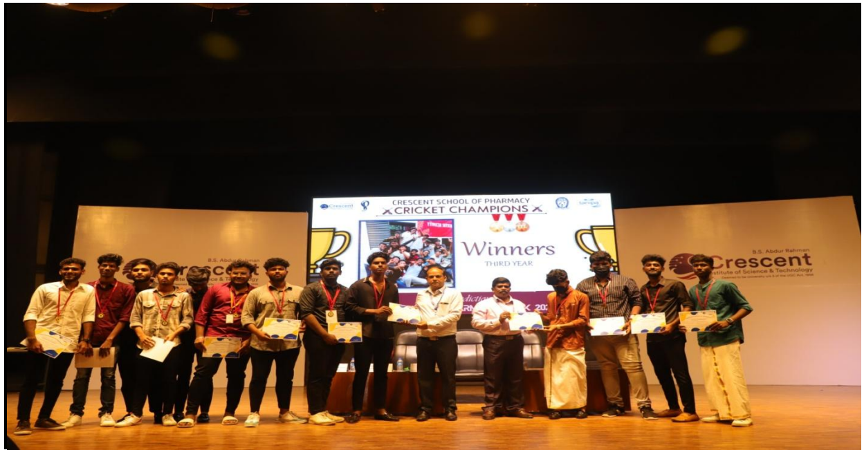
Prize Distribution for Sports