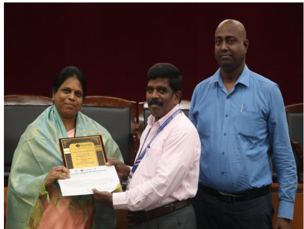
Felicitation of the Jury Members