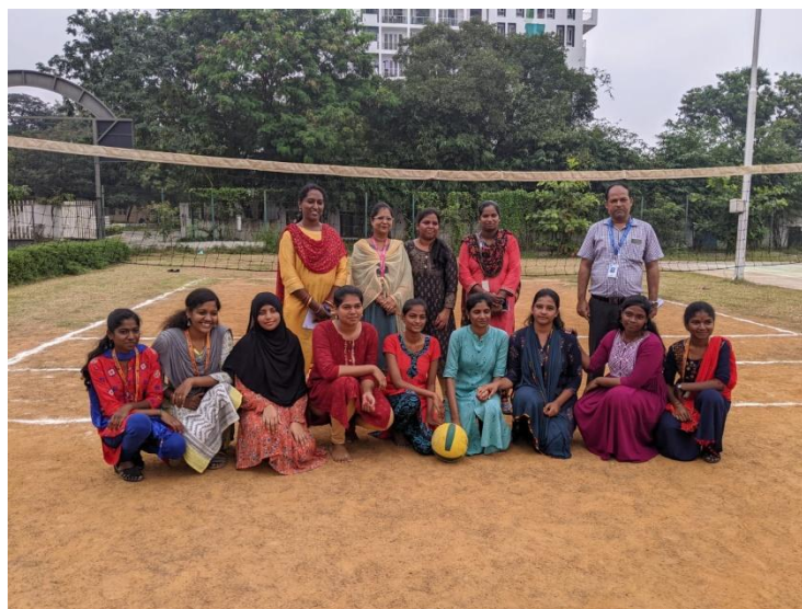
Throwball for Girls of B.Pharm.