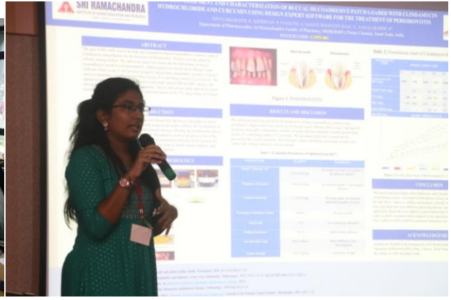
Glimpse of presentation