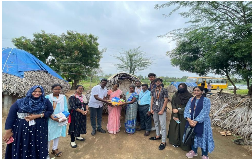
With Head Gram Panchayat and President of Annai Teresa Charitable Trust