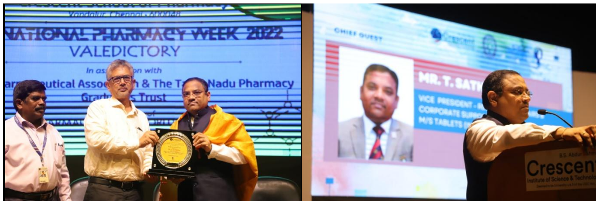
Chief Guest felicitation and Talk