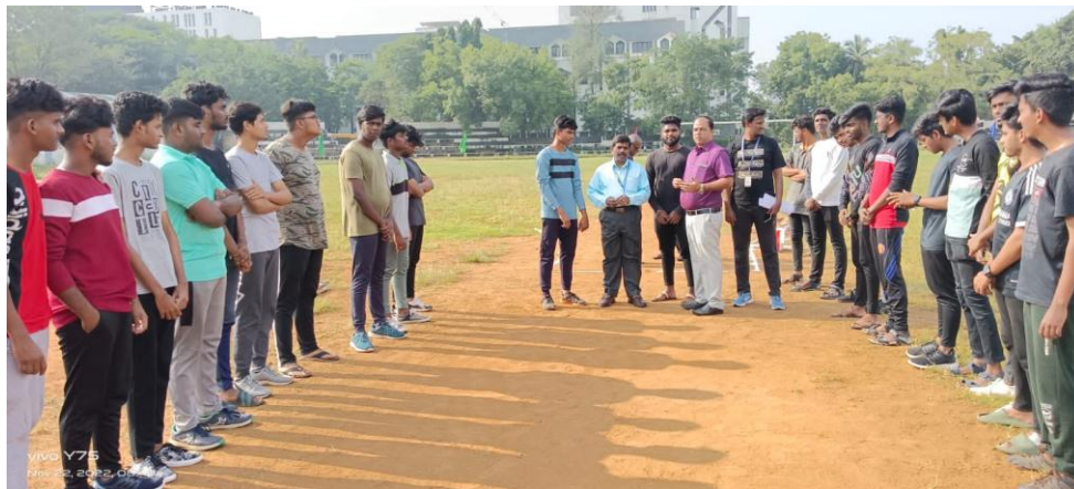
Cricket for Boys of B.Pharm.