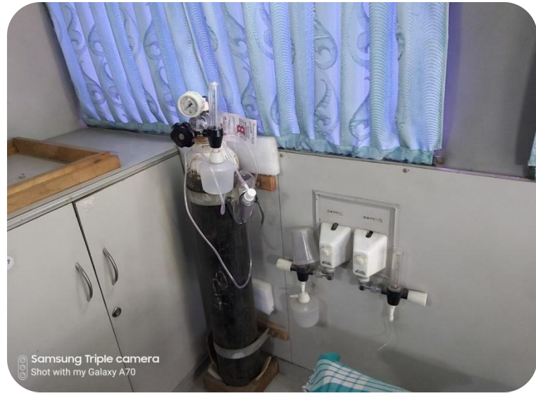
Samsung Triple camera Shot with my Galaxy A70