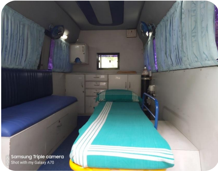
Samsung Triple camera Shot with my Galaxy A70