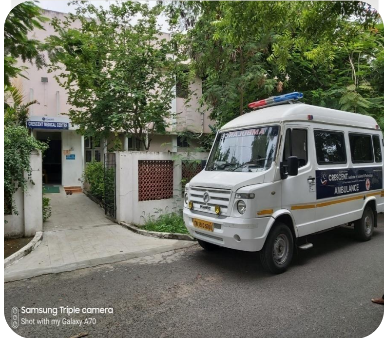
Samsung Triple camera Shot with my Galaxy A70