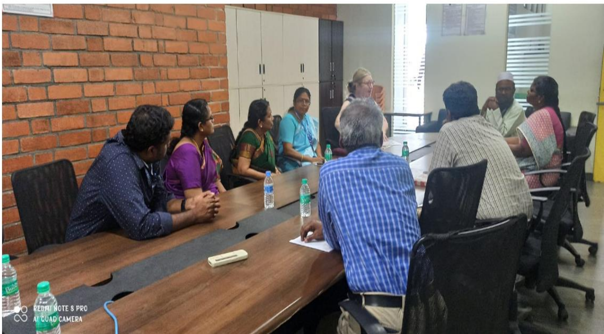
Meeting with Deans and HoD's