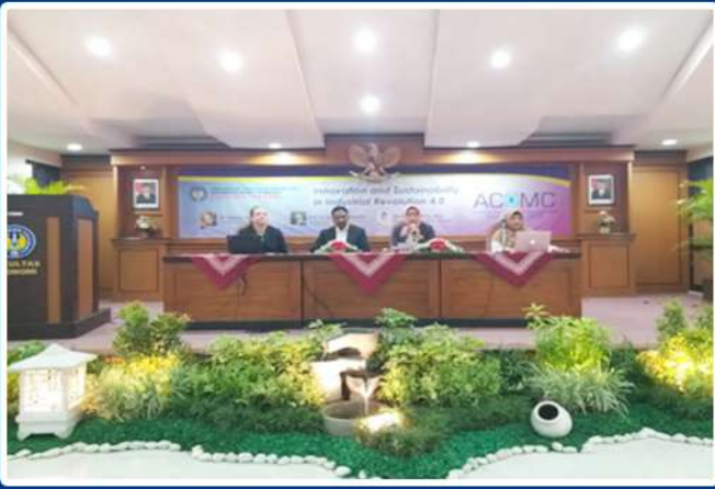
International Conference at University Negeri, Indonesia