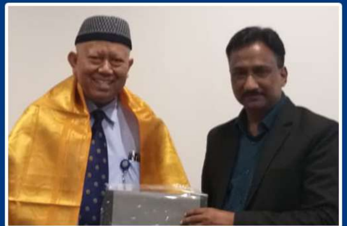
MOA With University Negeri , Indonesia