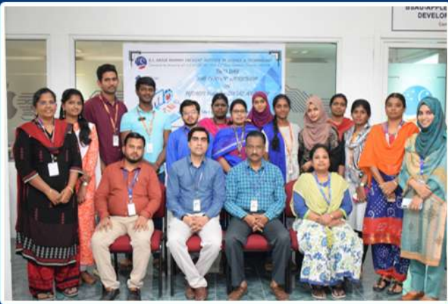
Two Day Workshop on Python