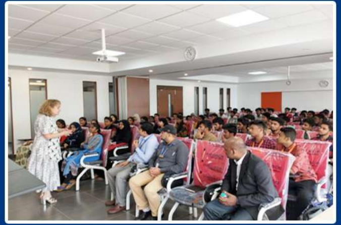
International Guest Lecture By ACCA Faculty