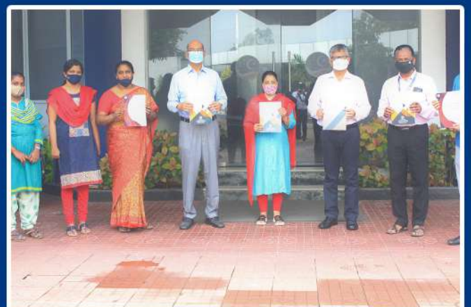
Release of International Journal