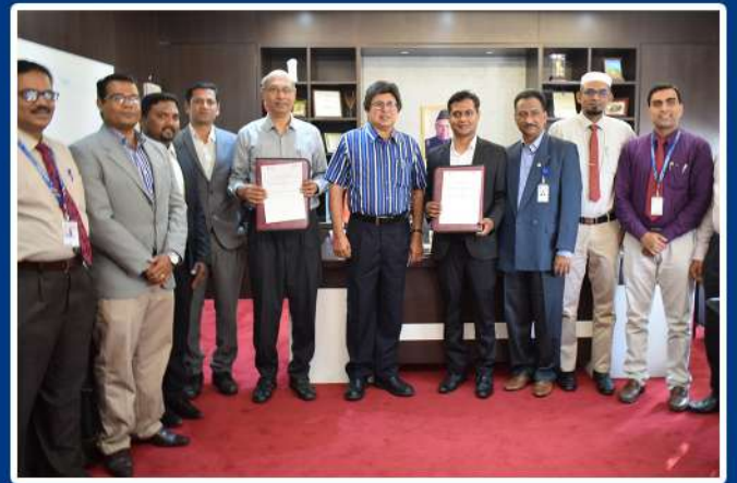
MOU with ISDC U.K