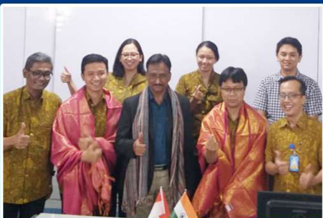
MOU with University Atma Jaya , Indonesia