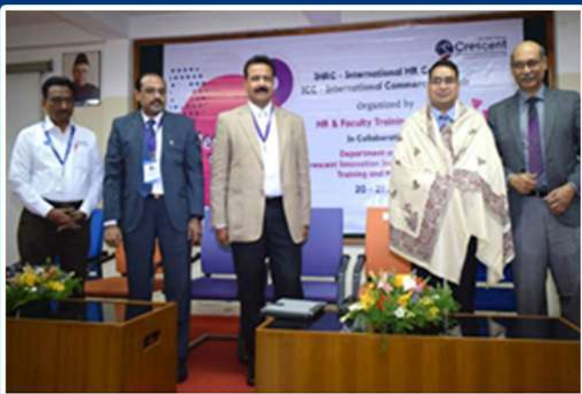
International Conference on HR CON FAB