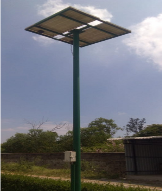
Near Sports Village Road

Installed towards staff quarters to Men's hostel road and Architecture block area. This project was done by our III yr. EEE students along with our Estate electrical dept. team.