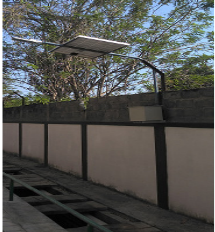
Near Architecture Block