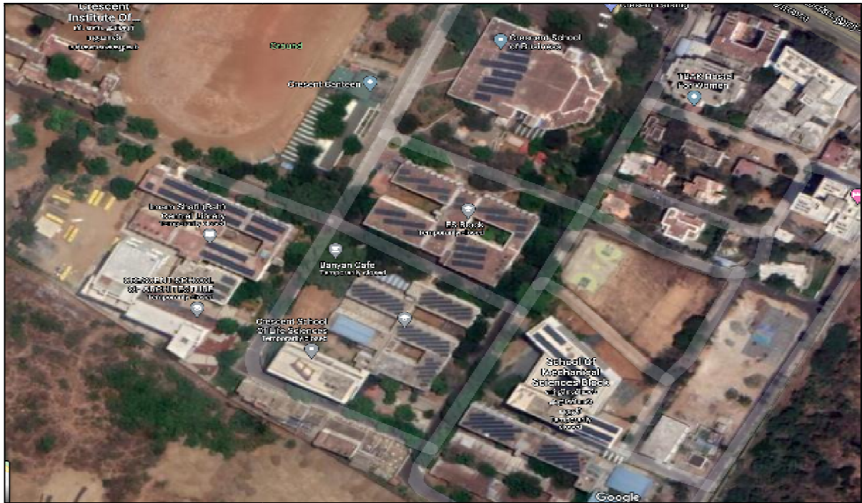
Google Satellite Map View