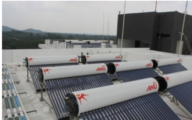
New Staff Quarters