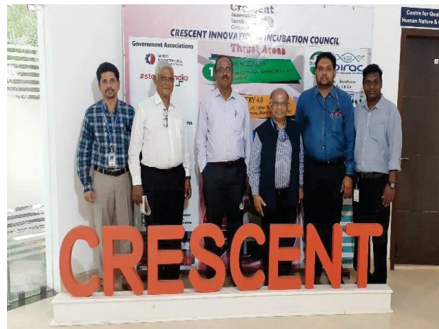
Visit to Crescent Innovation and Incubation Council