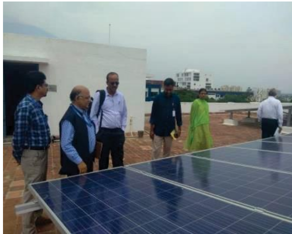
Visit to Solar Plant