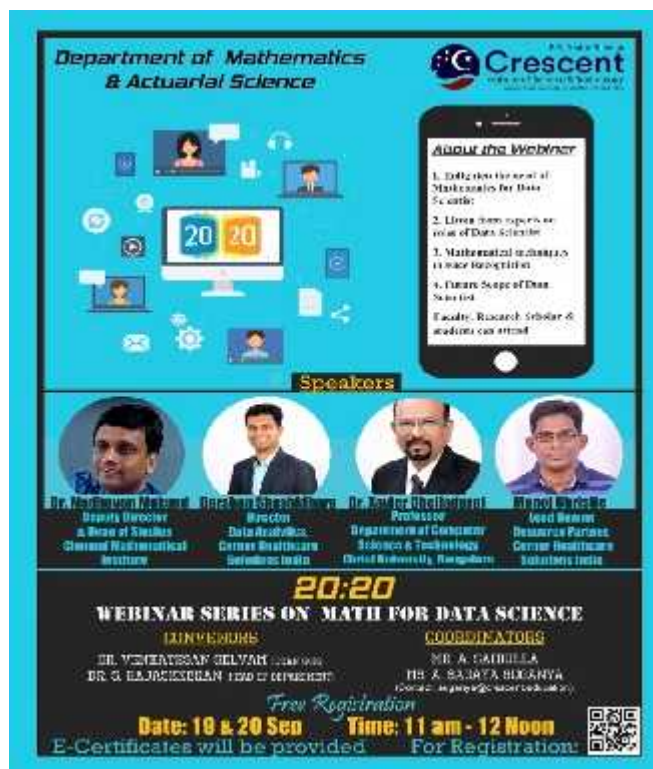
Brochure of the Webinar

The brochure highlighting the necessary information about the webinar series was designed and circulated.