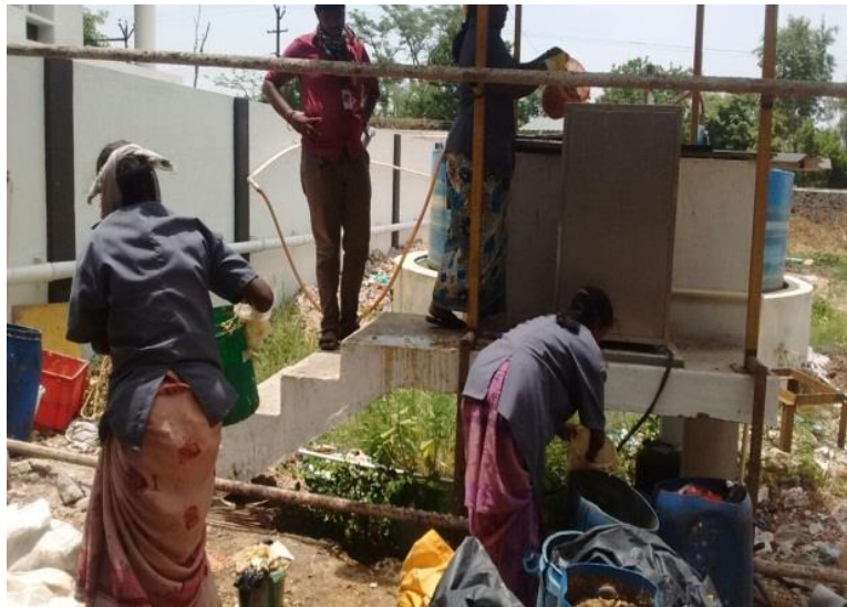
Food waste feed in to Bio gas plant