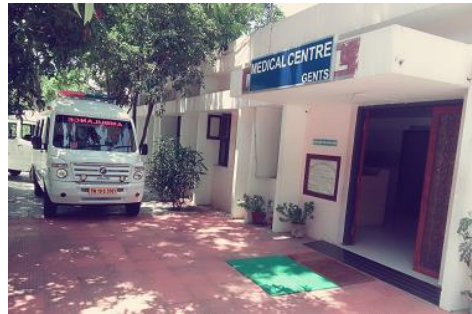
Men's Medical Centre – Entry

In our Institute we have 2 Medical Centre – 10-bed for Men's and 6-bed for Women's - with 24x7 residential doctors and staff nurses. Medical Centre have all Medical facility like General ward, Ambulance with 24x7 driver, first aid kit and necessary equipments for any emergency purpose. Our Institute vehicles and laboratories also have First Aid kit box. A tie-up with AG Hospital in Tambaram is in place for further treatments.