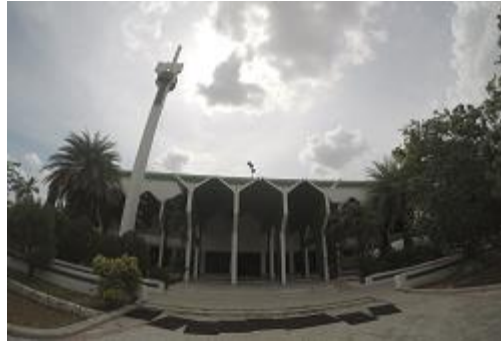
Prayer hall for Institute