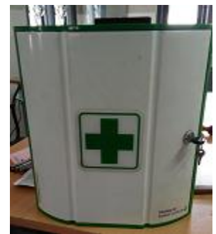
First Aid box