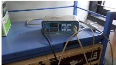
Pulse oxy meter