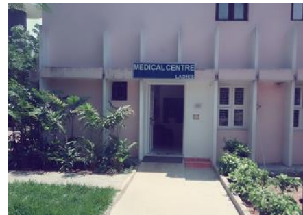
Women's Medical Centre Entry