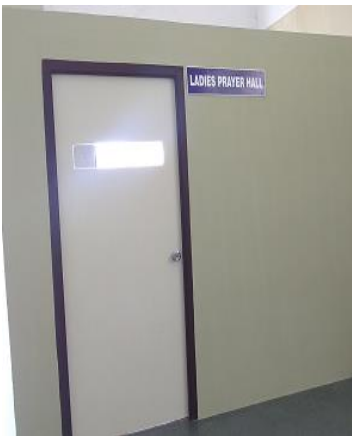
Women's Prayer Hall