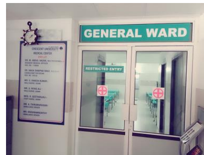
Men's Medical Centre – General Ward