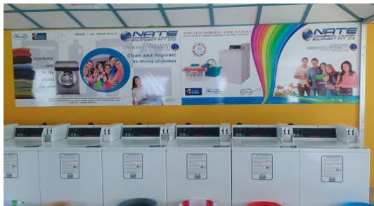
Automatic Laundry Machines