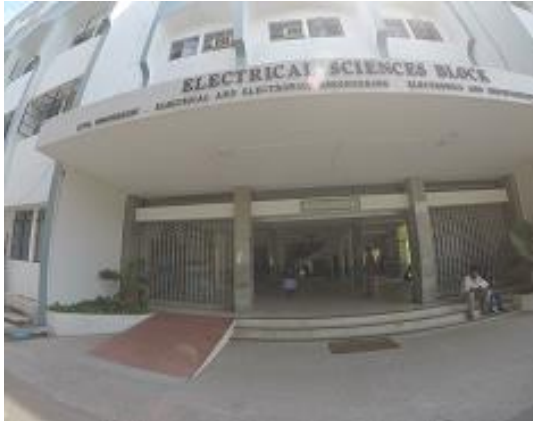
Electrical Science Block

All buildings are constructed with a facility of ramps and lifts for Persons with Disabilities.