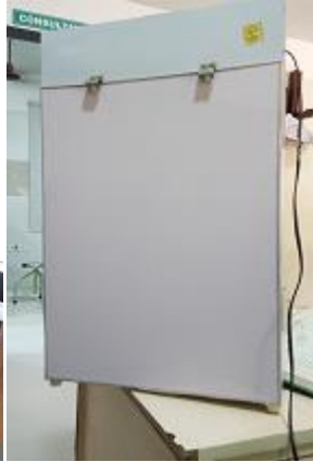
X ray Lobby