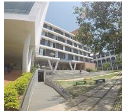
School of Mechanical Science Block