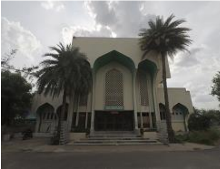
Men's Hostel Prayer hall

In our campus we have 2 prayer halls, one in Men's Hostel and another in Institute campus. For Women we have separate prayer hall in Hostel, Convention Centre & Community hall.